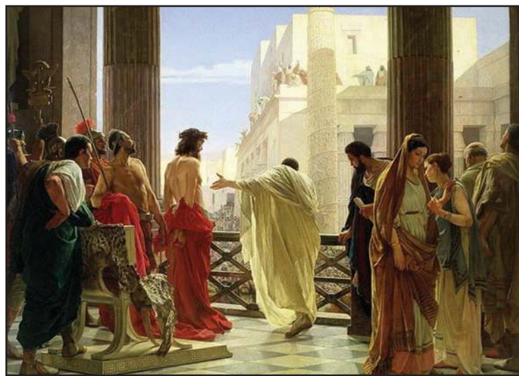
Antonio Ciseri's depiction of Pontius Pilate presenting a scourged Christ to the people. "Ecce homo!" (Behold the man!)