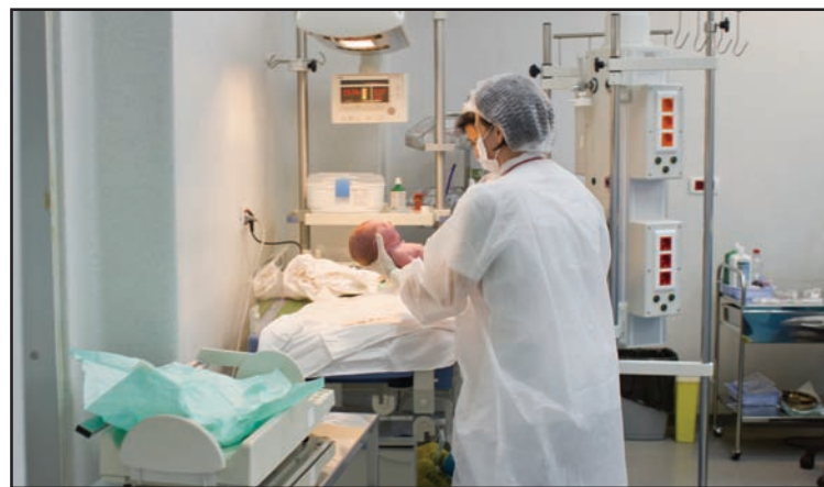
According to data from the CDC, the number of babies born in the U.S. has declined to the lowest total since 1987.

The summary of highlights from the Survey of Adult Skills which tests literacy, numeracy and problem-solving in technology-rich environments, showed millennials aged