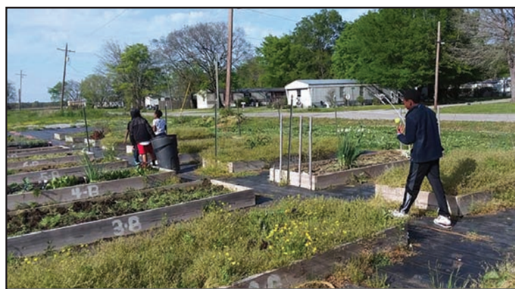
Shade Tree Missions has used this community garden as one of several ways to minister in northeast Louisiana. The garden provides a segue to discuss the Gospel.

For more information about Shade Tree Missions, e-mail shade-