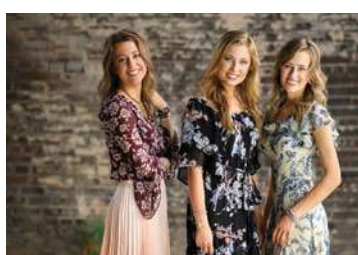
The Foto Sisters