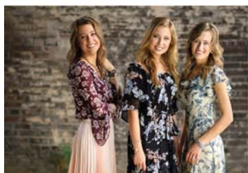
The Foto Sisters