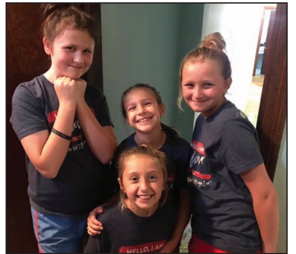
(Left and top photo) Children from the First Baptist Church in DeQuincy celebrate their decision to follow Christ at Kids Camp with a joint baptism service.