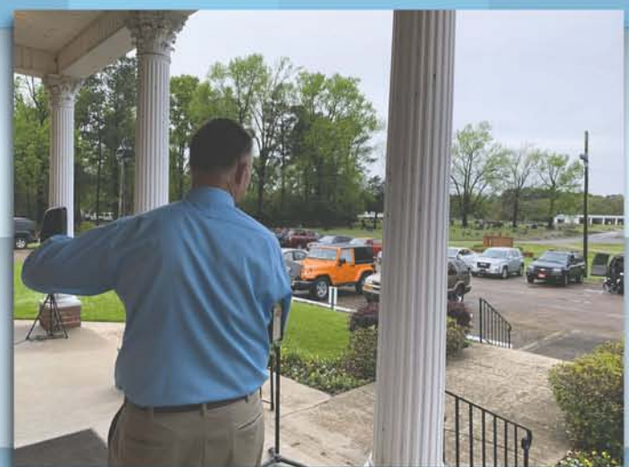
Tioga First Baptist Church, Baptist Message "Louisiana Baptist Churches Drive in, Logon to Adapt During COVID-19 Crisis"

Local congregations are finding ways to creatively connect with each other and their communities.