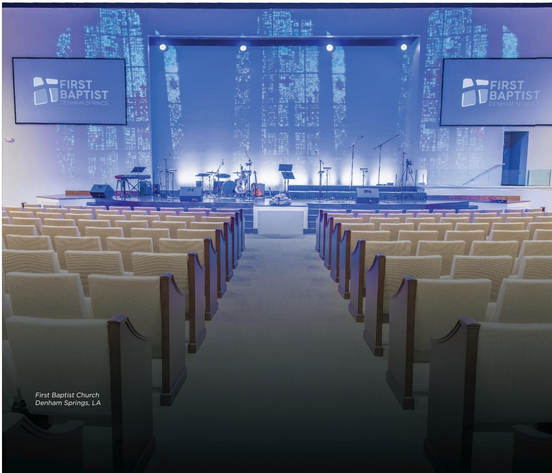
First Baptist Church Denham Springs, LA