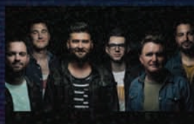
RUSH OF FOOLS